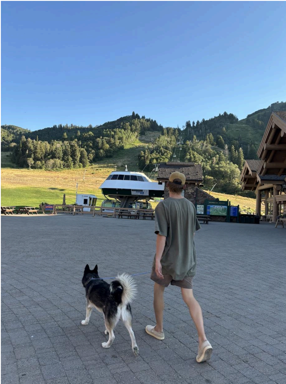
Caption: Dogs Welcome! Snowbasin is animal friendly. Alongside the miles of mountain bike and hiking trails, we have lesser-known horse trails all over the mountain. I think this is a great post for social media because it is casual, shows the beauty of the mountain, and demonstrates the ability to bring dogs which is unlike most other Utah Mountains.