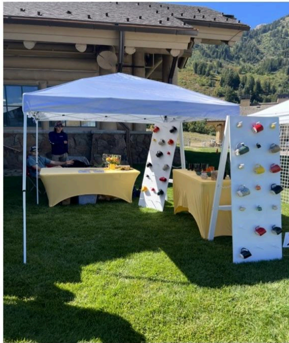
Pineview Pottery Tent

The local shops range from culinary items such as food to art and services. The image to the right shows one of the many shops at Snowweisn. This shop was called Pineview Pottery. The local potters actually source the clay from a local reservoir. They told a cool story about their process and how it differs from other potters. Most of the process is in preparing the raw clay prior to the creation of mugs or pots.